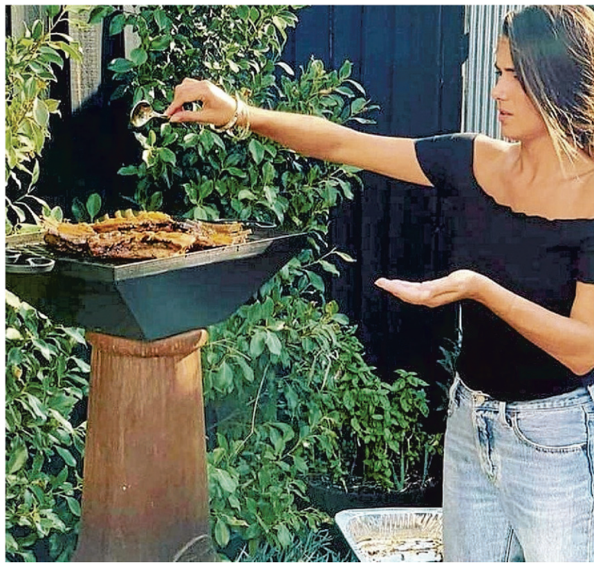
Whether you're heating or cooking, an Aussie Heatwave Fireplace can sort you out.