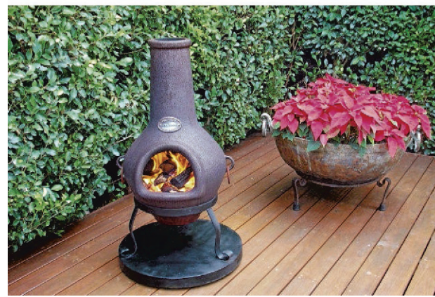
Be sure to check out Aussie Heatwave Fireplaces at the Mudgee Small Farm Field Days- Row G.

commonly found with inferior versions. "The real benefits are that they radiate much more heat over a wider area, are virtually indestructible, and are totally pyromaniac proof.